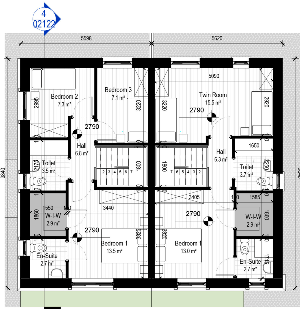
2: BHC2 - L01 First Floor Plan Scale - 1 : 100