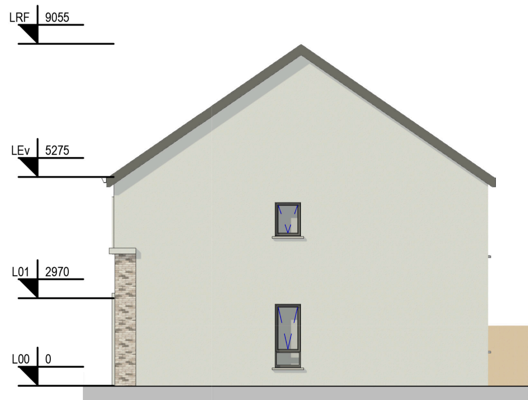
8: BHC2 Right Side Elevation Scale - 1 : 100