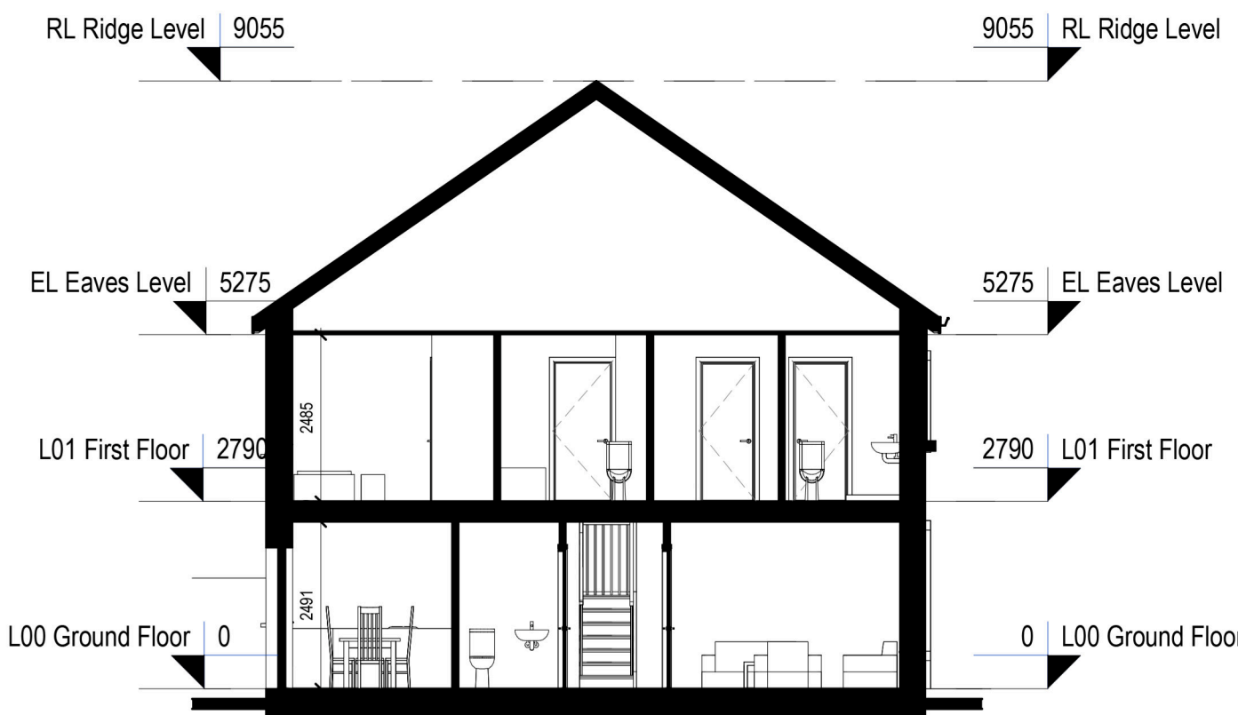
4: BHC2 Section Scale - 1 : 100