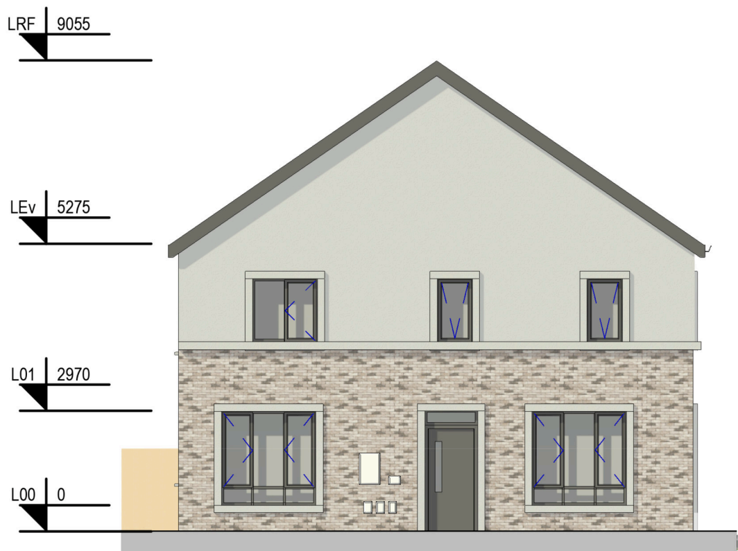
6: BHC2 Left Side Elevation Scale - 1 : 100