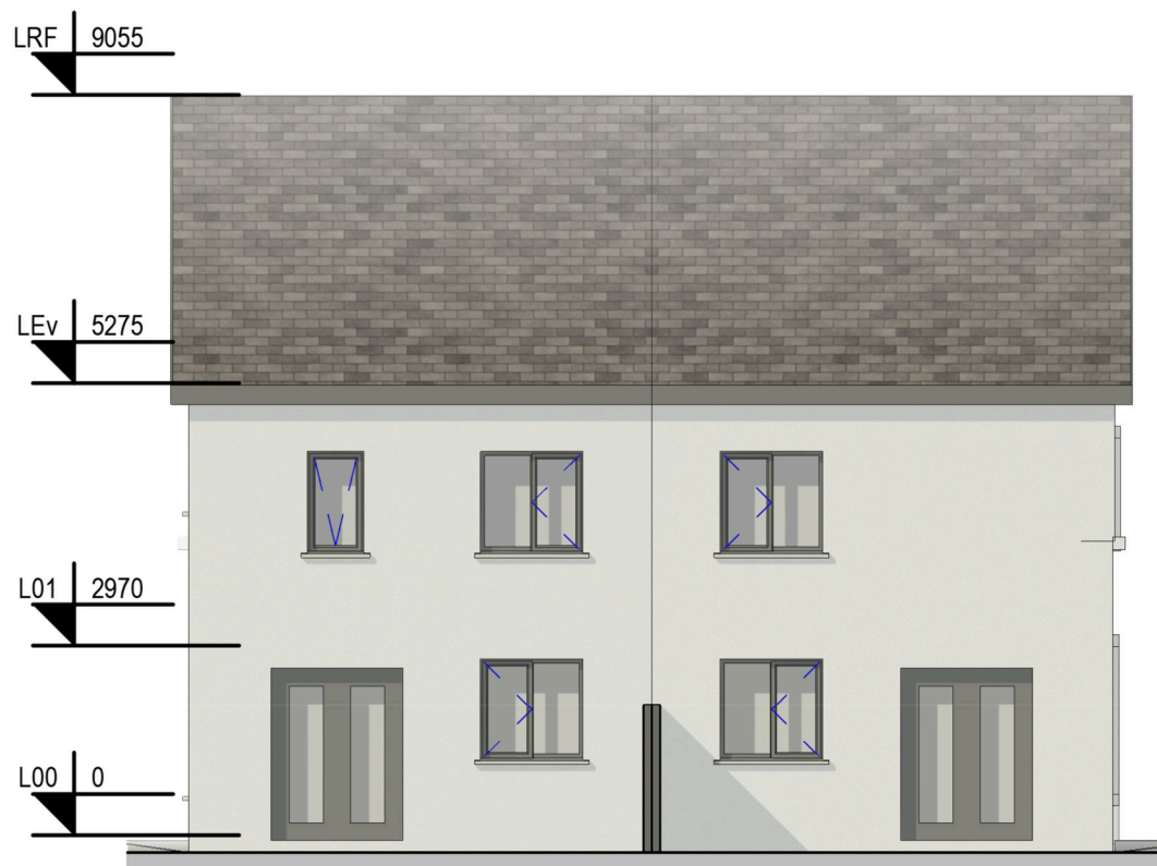
7: BHC2 Rear Elevation Scale - 1 : 100