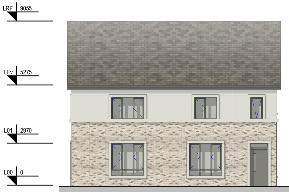
5: BHC2 Front Elevation Scale - 1 : 100