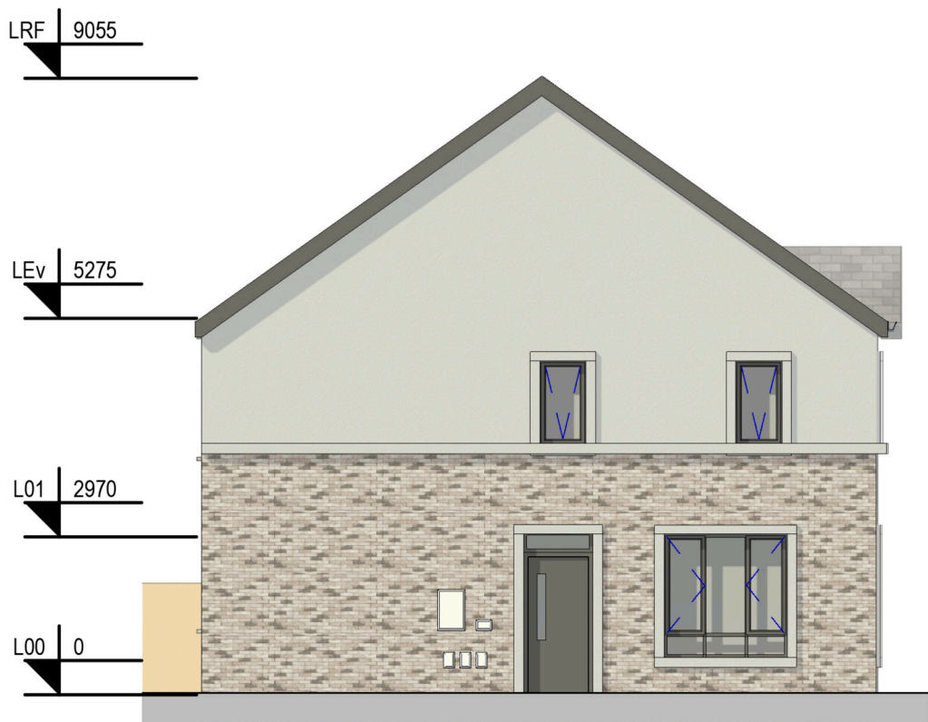
6: BHC3 Left Side Elevation Scale - 1 : 100