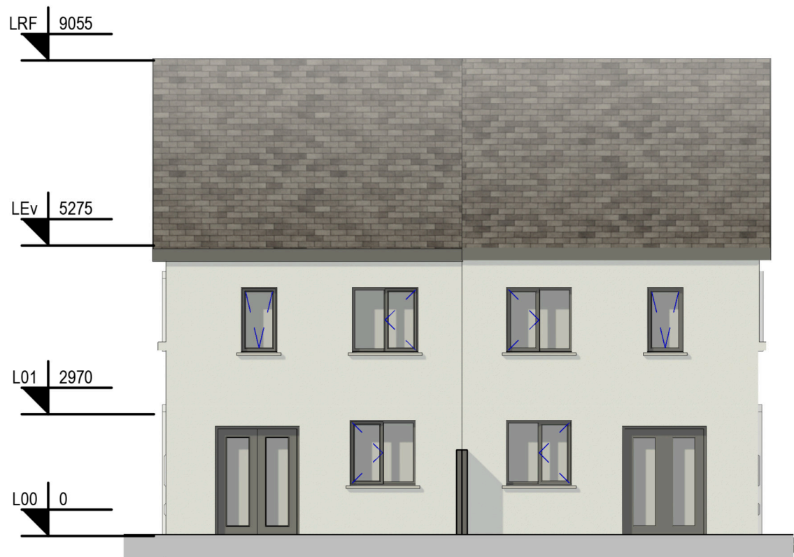
7: BHC3 Rear Elevation Scale - 1 : 100