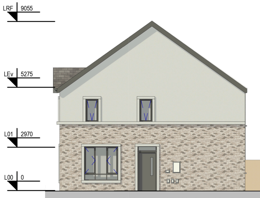
8: BHC3 Right Side Elevation Scale - 1 : 100