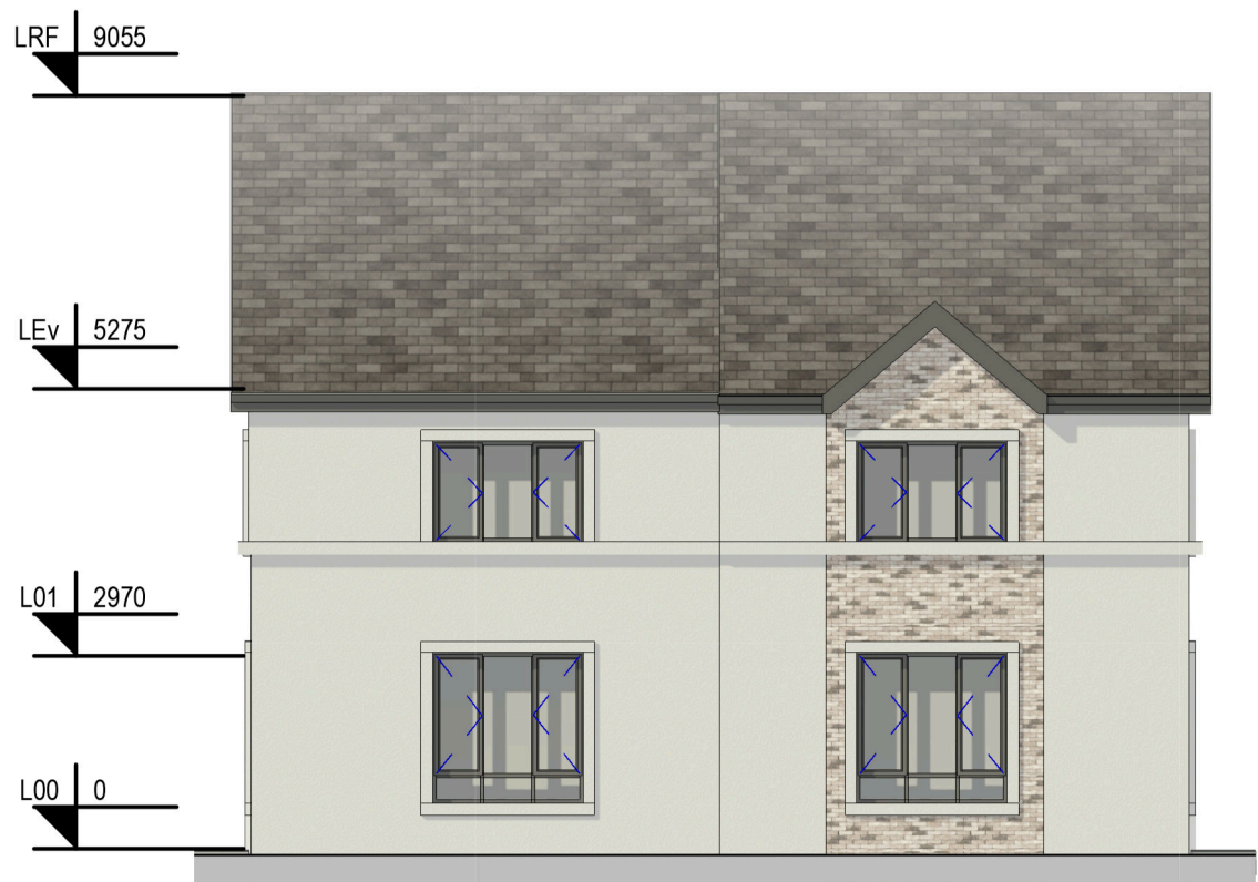
5: BHC3 Front Elevation Scale - 1 : 100