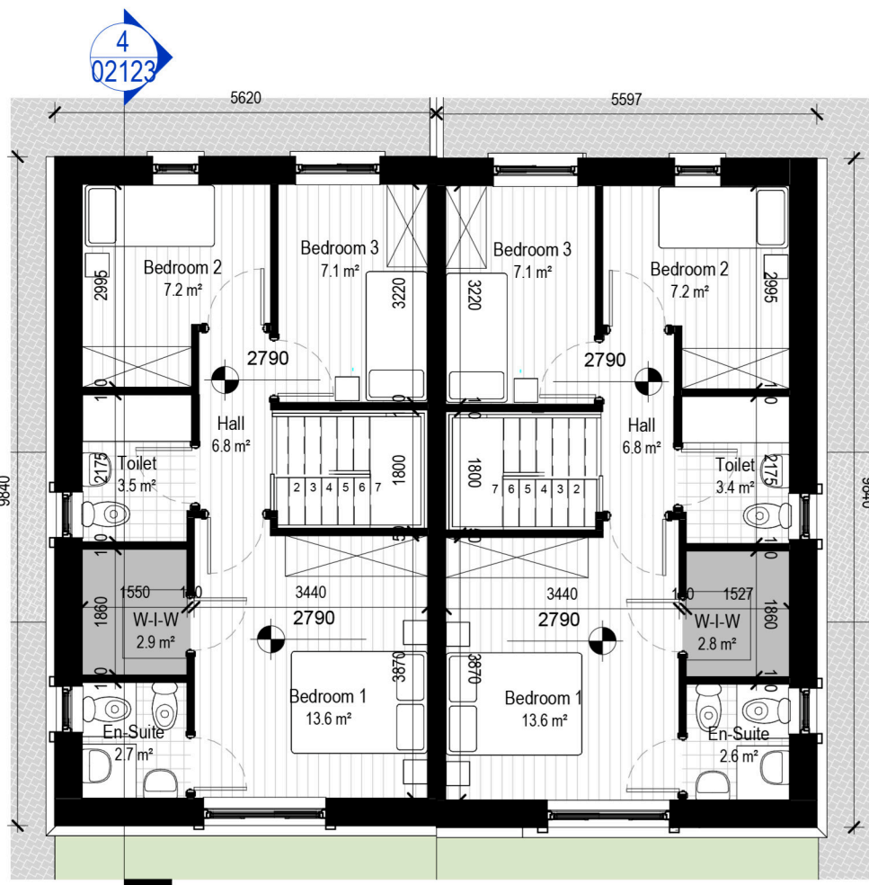
2: BHC3 - L01 First Floor Plan Scale - 1 : 100