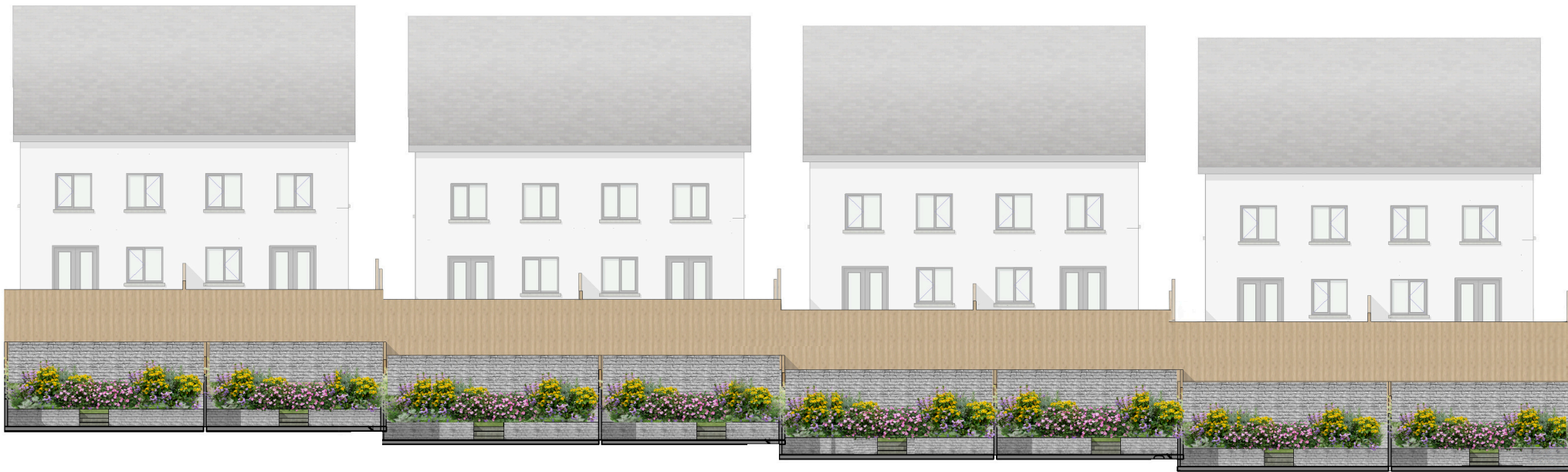
5: Section 3-3 Scale - 1 : 200

Boundary Type 2: Retaining walls separating Private Properties at the Back Varies in Height according to the difference in levels between properties