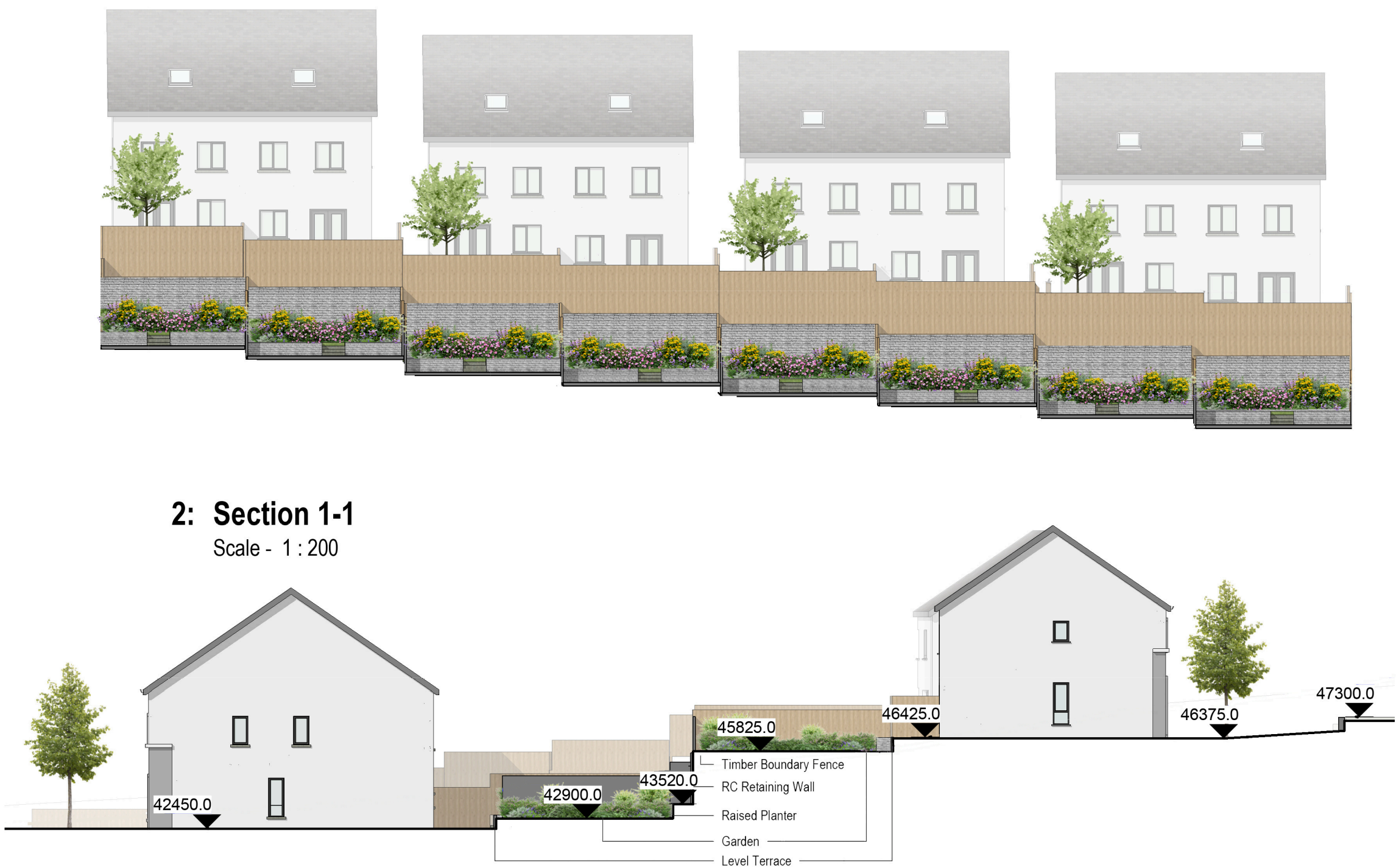
2: Section 1-1 Scale - 1 : 200