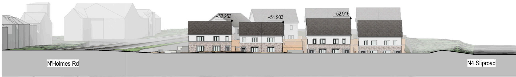
E2: Street Elevation E2 - Homezone Facing South