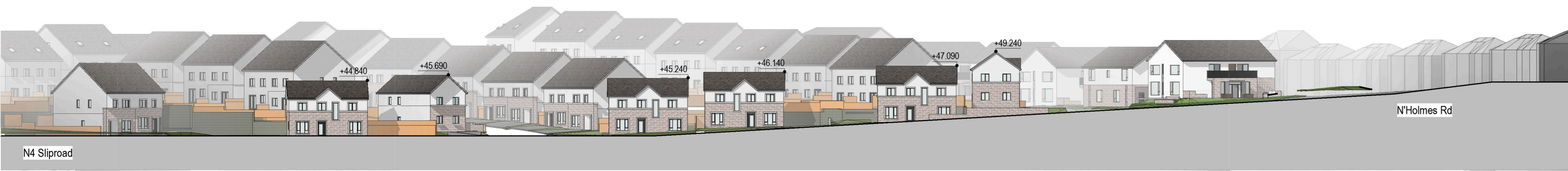
C1: Street Elevation C1 - Main East-West Road Facing North