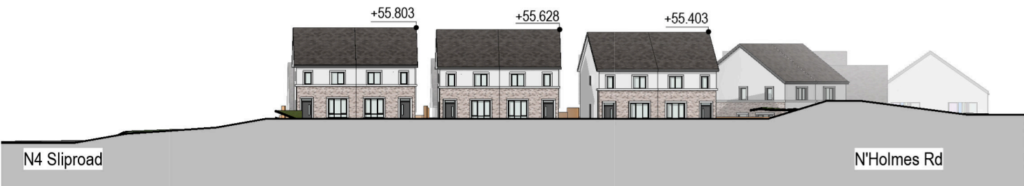
F: Street Elevation F - Homezone Facing North