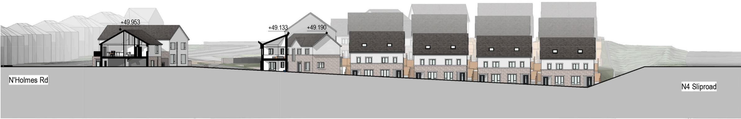
D: Street Elevation D - Homezone Facing south