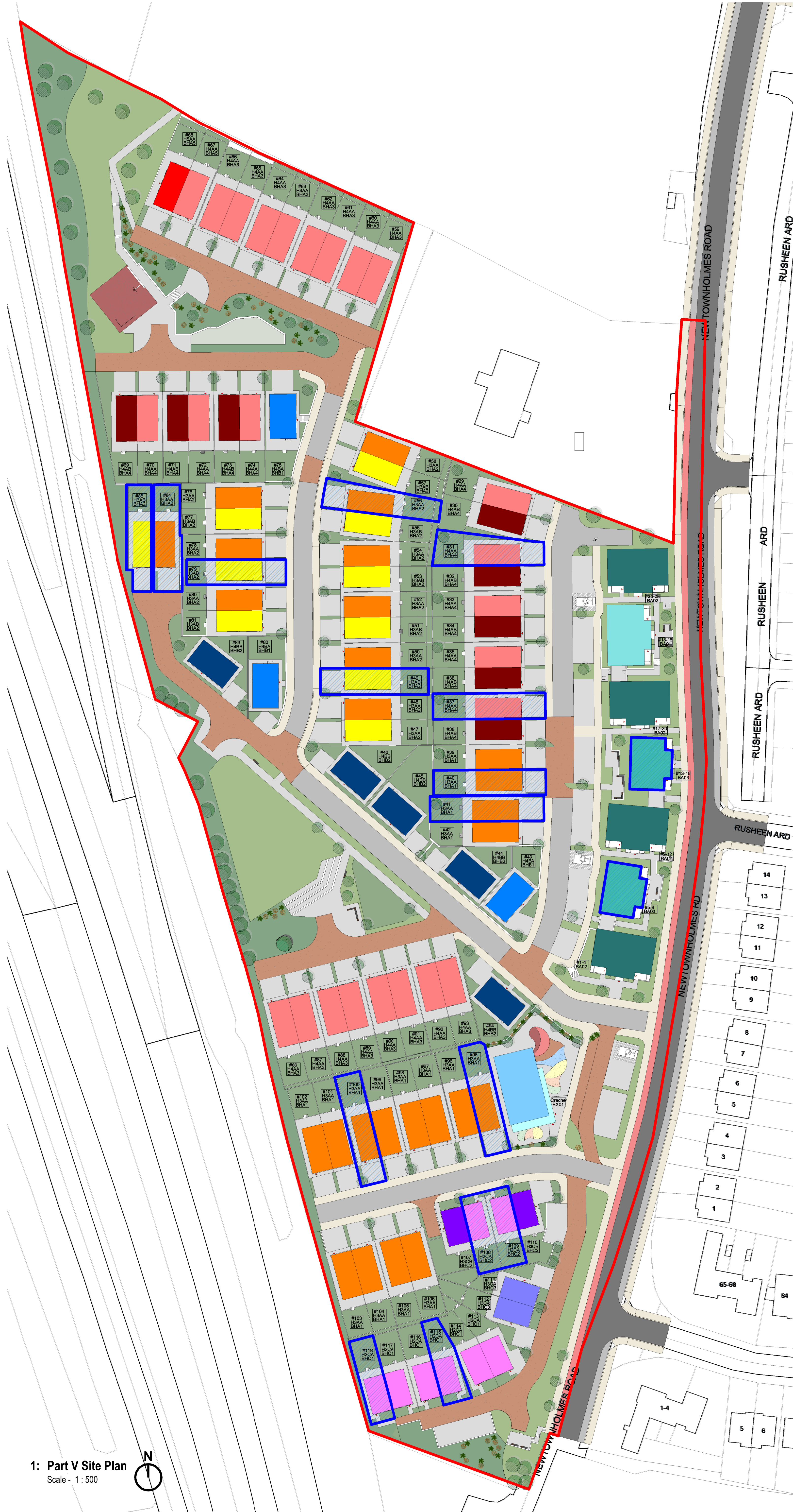
1: Part V Site Plan Scale - 1 : 500