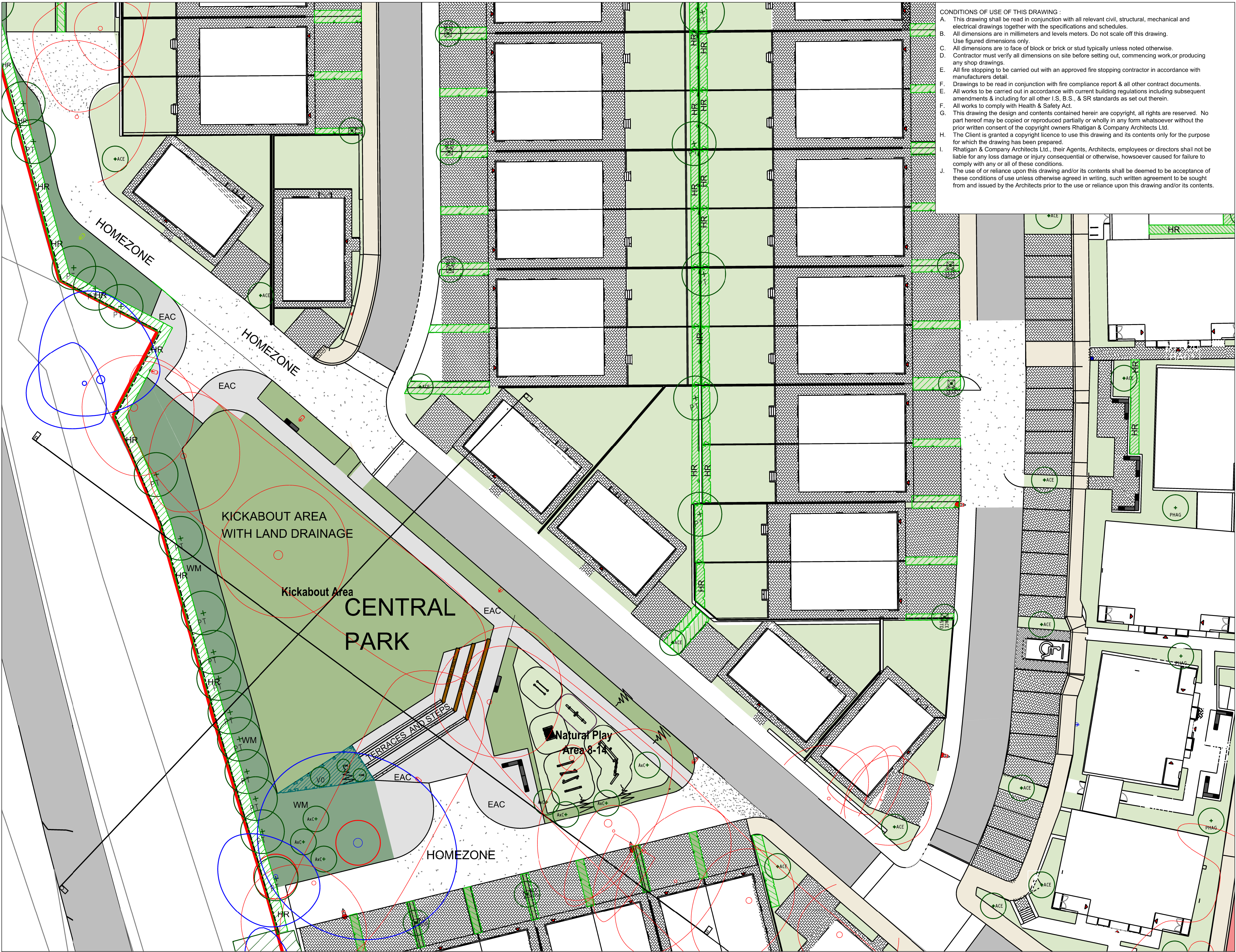
CENTRAL PARK LANDSCAPE PLAN 1: 250